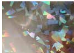
Clear Cracked Ice